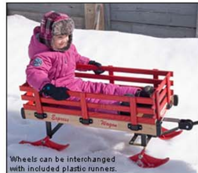
Wheels can be interchanged with included plastic runners.